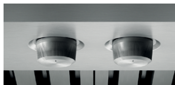
metallic rotating knob controls