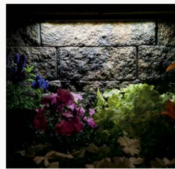
Cool White 4200K