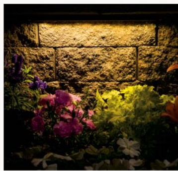
Warm White 2700K