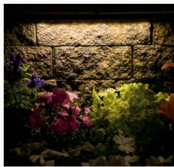
Pure White 3000K