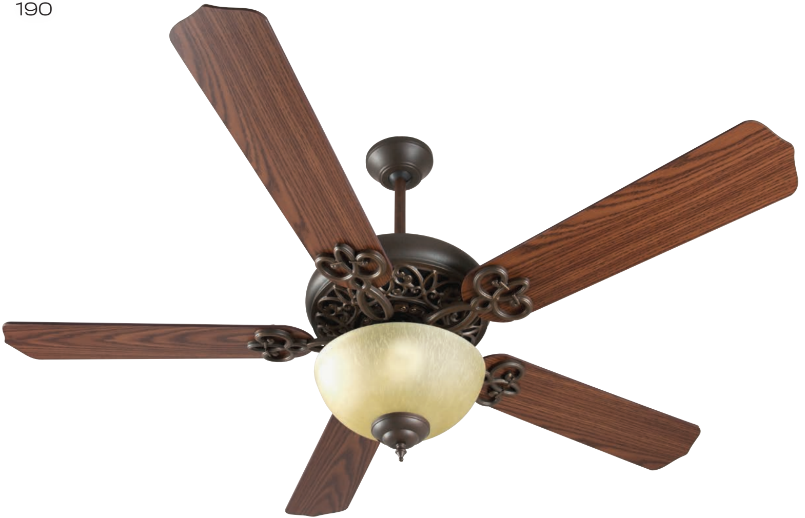
Aged Bronze Textured Cecilia Unipack with 52" Contractor's Design Dark Oak Blades and Tea-Stained Bowl Light Kit Model . . . CCU52AG Blade . . . BCD52-DOK Light. . . . Included