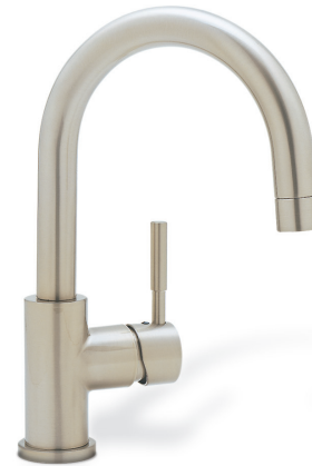
Model 440954 shown