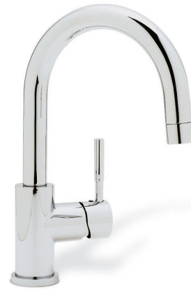
Model 440953 shown