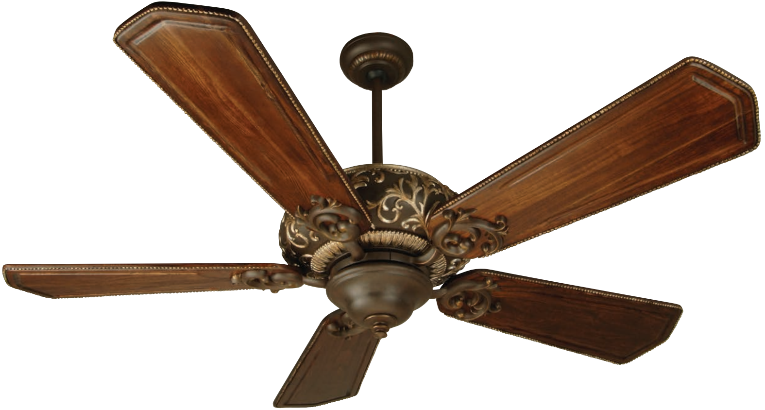
Aged Bronze/Vintage Madera Ophelia with 56" Custom Carved Ophelia Walnut/Vintage Madera Blades | Model . . . OA52AGVM Blade . . . . B556C-OA8 Light. . . . . Not Shown