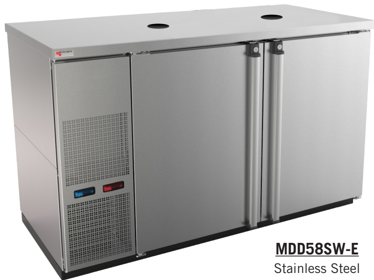
MDD58SW-E Stainless Steel