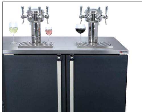
Shown: 2 Wine Fonts (MTM-4PSS-W), 2 Drip Trays (DP-1020). Order separately.