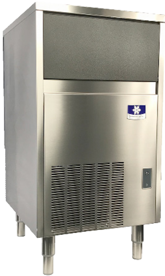
Model USP0100 CrystalCraft Ice Machine