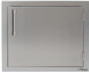
23" SINGLE ACCESS DOOR Left Door: AXE-23L Right Door: AXE-23R