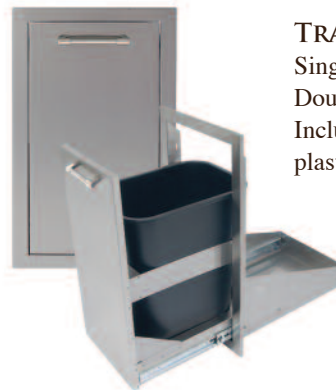
TRASH CENTER DRAWER Single Bin: AXE-TC Double Bin: AXE-TC2 Includes durable plastic receptacle(s)