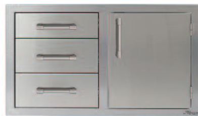
32" COMBO DOOR & DRAWERS Door on Left: AXE-DDC-L Door on Right: AXE-DDC-R