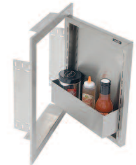
Doors feature multiple mounting options and internal storage unit.