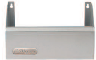
ACCESSORY SPEED RAILS 14" Wide Rail: RAIL-14 19" Wide Rail: RAIL-19