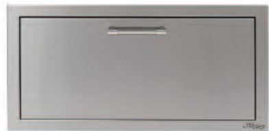
30" STORAGE DRAWER Oversize for large pans Model: AXE-30DR