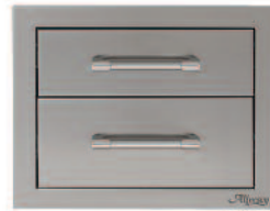
STORAGE DRAWERS 2 Drawer Unit: AXE-2DR