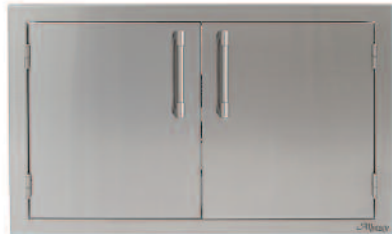
DOUBLE ACCESS DOORS 30" Wide Doors: AXE-30 36" Wide Doors: AXE-36 42" Wide Doors: AXE-42