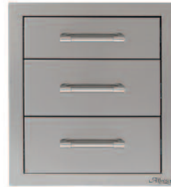
STORAGE DRAWERS 3 Drawer Unit: AXE-3DR