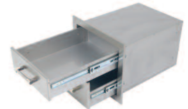
Drawers pull out on German engineered smooth gliding full-extension slides.