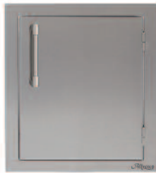
17" SINGLE ACCESS DOOR Left Door: AXE-17L Right Door: AXE-17R