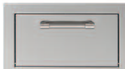
PAPER TOWEL HOLDER For standard paper towel rolls: AXE-TH