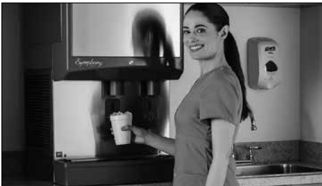
SensorSAFE not recommended for use with clear containers or for applications in direct sunlight

SensorSAFE™ infrared dispense (optional)