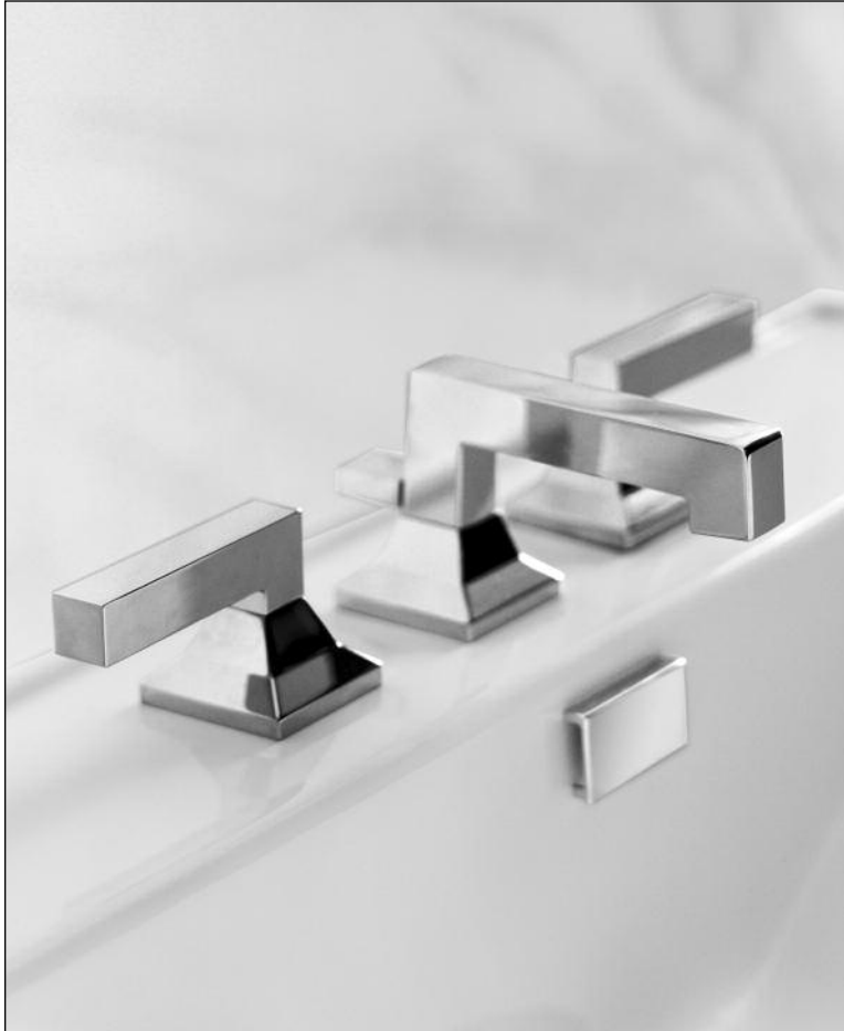
TL930DDL#CP - Lloyd® Widespread Lavatory Faucet