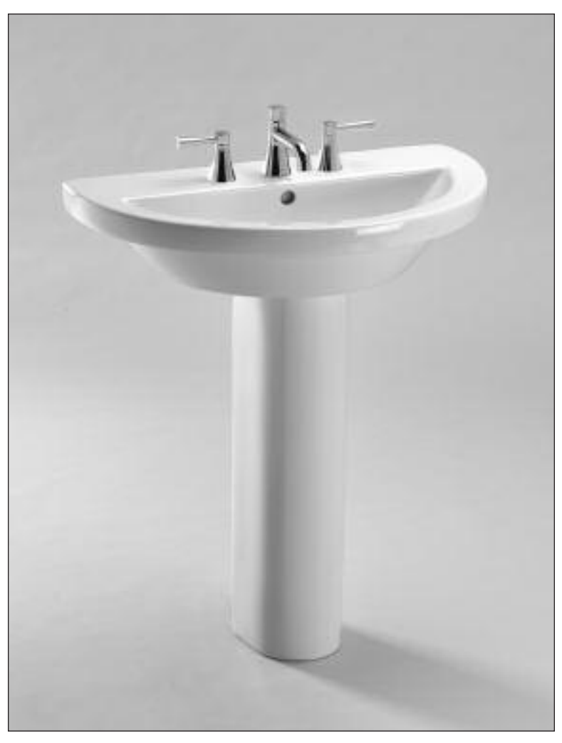
LPT325.8G - Pedestal Lavatory