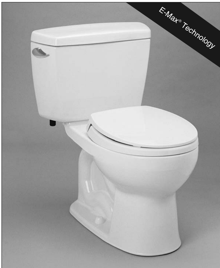
CST743E - Eco Drake® High Efficiency Toilet SS113 - SoftClose Seat