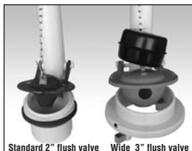
Standard 2" flush valve Wide 3" flush valve

Fast Flush: New, wide 3" flush valve is 125% larger than conventional 2" flush valves.