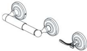
Robe Hook SA-1406