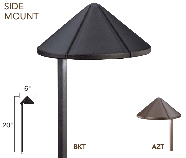
15005 AZT, BKT