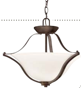
Shown as Inverted Pendant - 15.25" H.