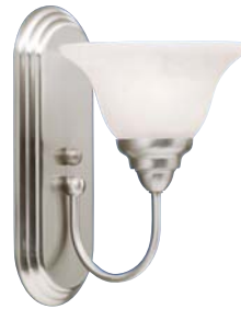
D | 5991 NI, OZ Wall Sconce