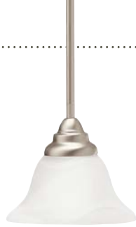
A | 3476 NI, OZ Mini Pendant

BRUSHED NICKEL FINISH WITH ALABASTER SWIRL GLASS OR OLDE BRONZE® FINISH WITH UMBER-ETCHED GLASS