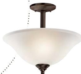
Shown as Semi Flush - 13.5" H.