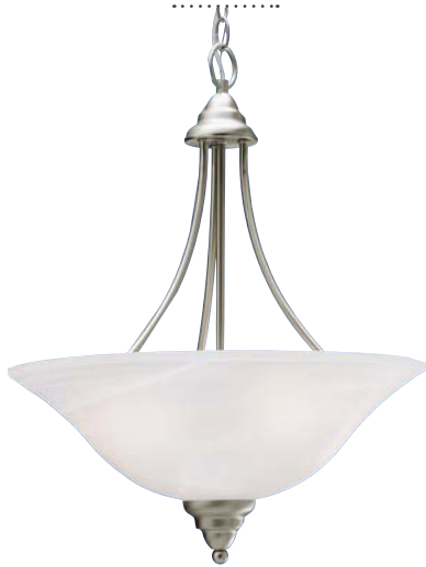
C | 3277 NI, OZ Inverted Pendant