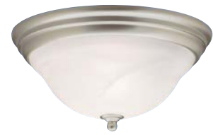
B | 8076 NI, OZ Flush Mount