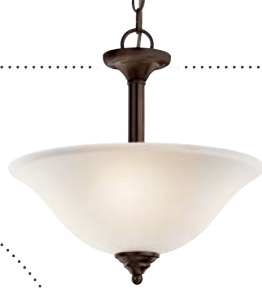
Shown as Inverted Pendant - 15.25" H.