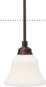
J | 3482 NI, OZ Mini Pendant