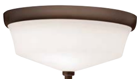
K | 8044 NI, OZ Flush Mount