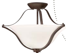
Shown as Semi Flush - 13.25" H.

Create two distinct lighting options with one fixture: Inverted Pendant or Semi Flush.