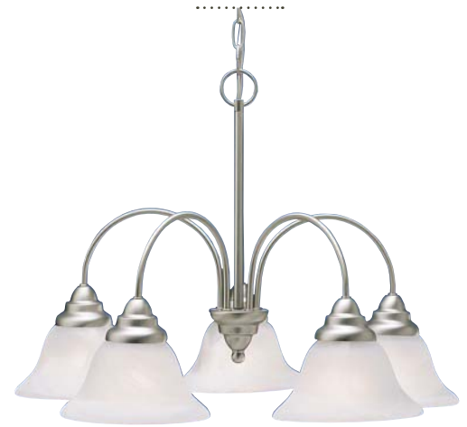
E | 2076 NI, OZ Chandelier