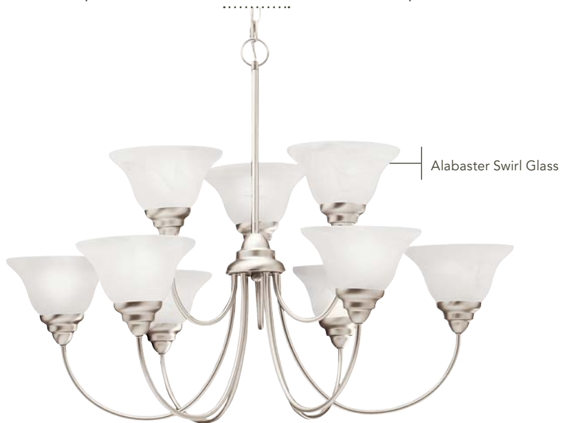
F | 2077 NI, OZ Chandelier