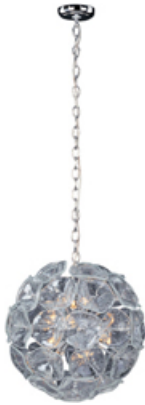
E22093-28 Cassini 12-Light Pendant