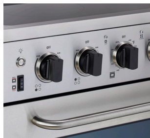
Modern knobs designed for easy use