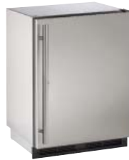
STAINLESS SOLID (LOCK)