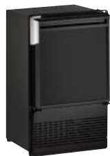
BLACK SOLID (FLANGE TO CABINET)