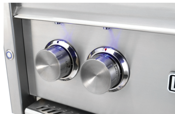
FLAMETRAK Indicator Error