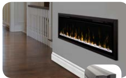
60" IgniteXL Trim Kit (XLFTRIM60) Allows installation of IgniteXL in 2"x4" wall construction. 62-3/4" x 18-1/4" x 1-7/8" (159.4 cm x 46.2 cm x 4.5 cm)

120 Volts | 1,500 Watts | 5,718 BTU 240 Volts | 2,500 Watts | 8,530 BTU