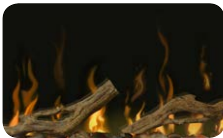
74" Driftwood and River Rock Accessory Package (LF74DWS-KIT)