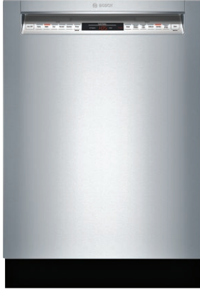
SHE68TL5UC Stainless Steel

The new 3rd rack now offers 30% more loading area. Perfect for ramekins, cooking utensils and extra-long silverware.