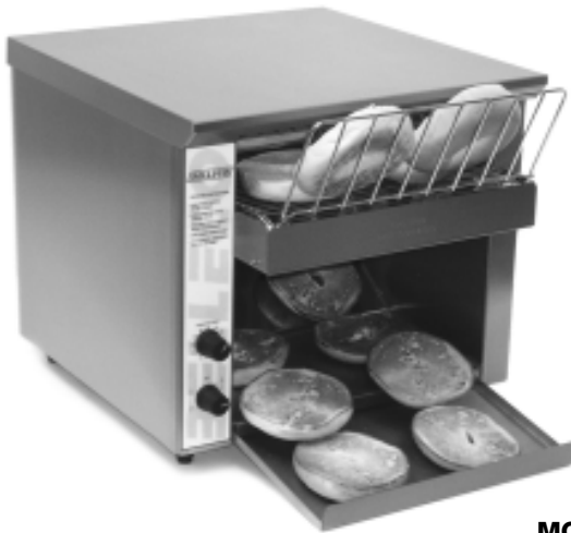
MODEL JT1-B SHOWN