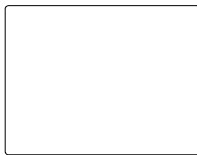
G66696 (7F) 3/4-27 Female

1.0 GPM (3.8 L) Pressure Compensating Spray Outlet (Complying with ASME A112.18.1/CSA B125.1).