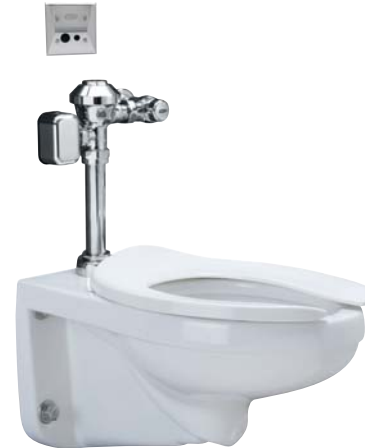
Z5615 Series Elongated (shown with seat)