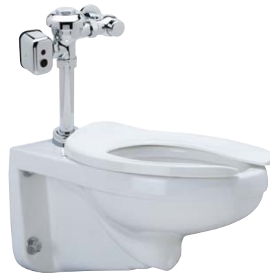
Z5615 Series Elongated (shown with seat)