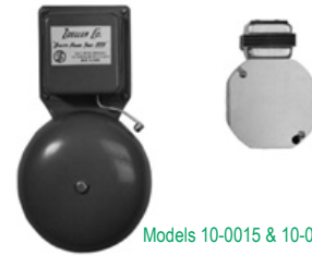
Models 10-0015 & 10-0016

NOTE: All variable level float switches in this section are mechanically activated and do not contain mercury.