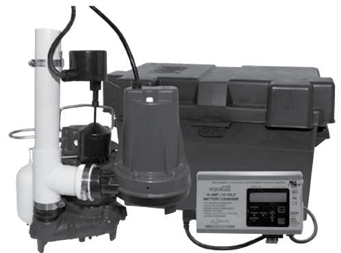
Primary pump not included. Product may not be exactly as shown. For preassembled systems, order a ProPak.