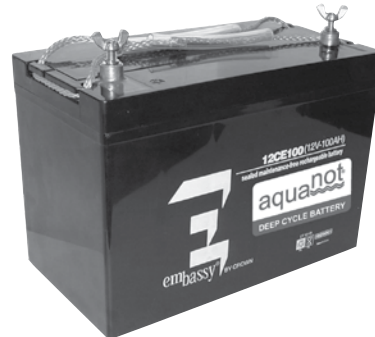
Aquanot® Deep-cycle Battery (purchase separately) P/N 10-1450 - AGM (shown) P/N 10-0761 - Wet

WARRANTY - 3 years from date of purchase.