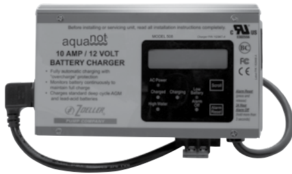
Model 508 Controller

Minimum pit size: 18" (46 cm) diameter X 22" (56 cm) deep. Minimum battery requirements: deep-cycle, size 27, 175 minute reserve capacity.