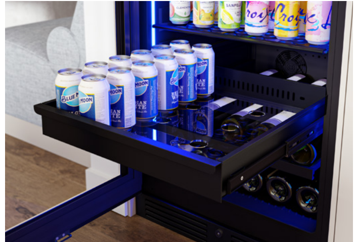
Full-Extension Rollout Bin with Transparent-Gray Glass