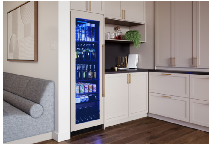
Accommodates custom wood overlay panels