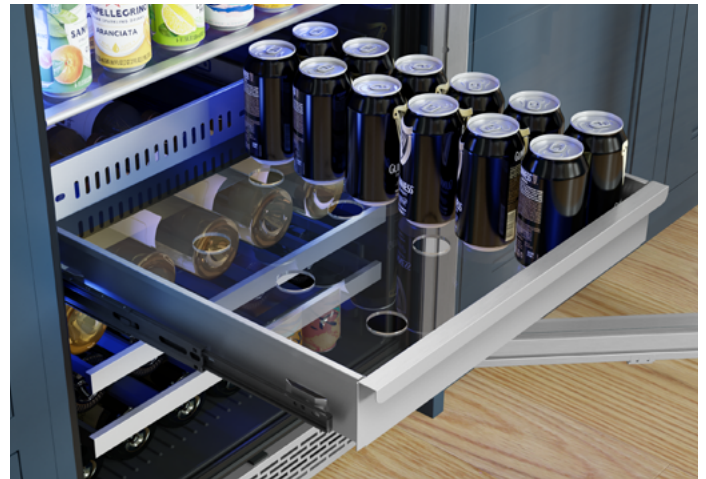
Full-Extension Stainless Steel Rollout Bin with Transparent-Gray Glass