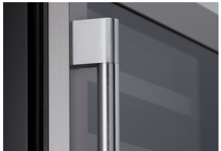
Optional Pro Handle