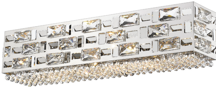
| I |