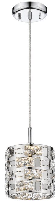
| K |