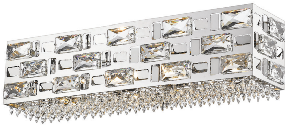
| H |