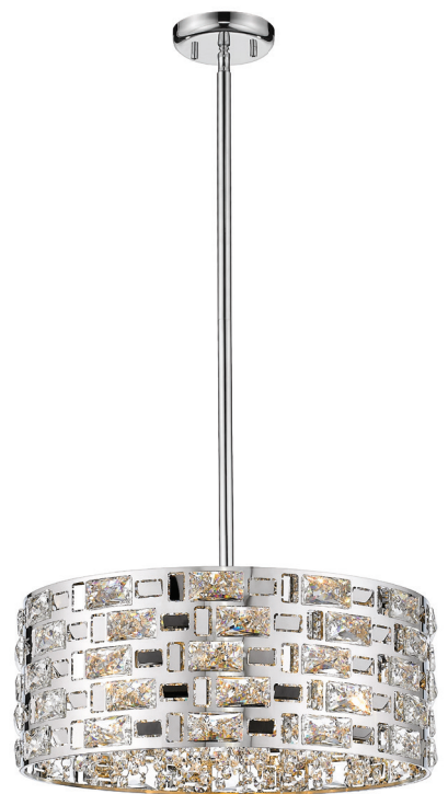
| E |