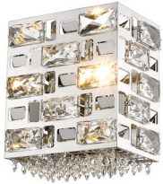
| F |

These fixtures can NOT be mounted up or down