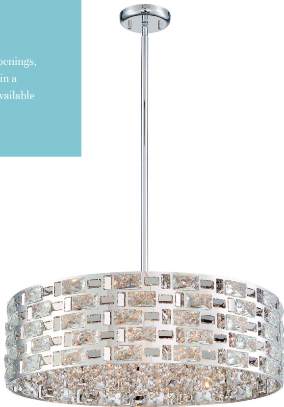
| D |