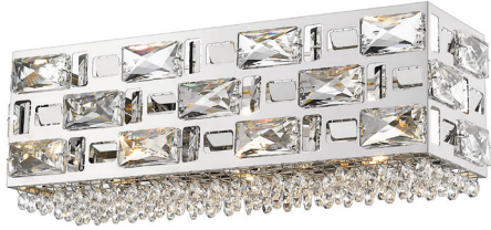
| G |