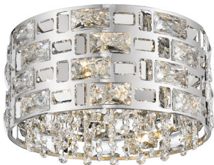
| A |

The contemporary styled laser cut design of the Aludra collection define its signature look. Through the varied openings, beautiful rectangle crystals are revealed and surrounded in a highly polished Chrome finish. The Aludra collection is available in different fixture types and sizes.