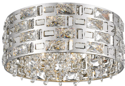
| B |