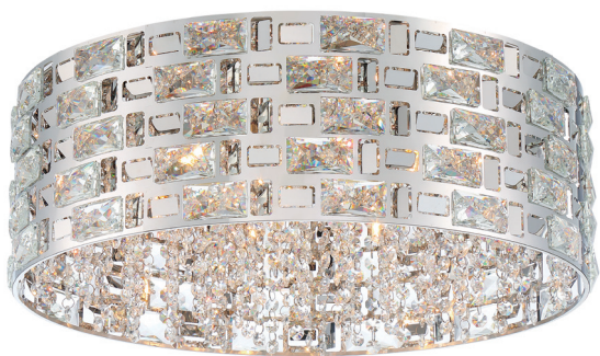
| C |