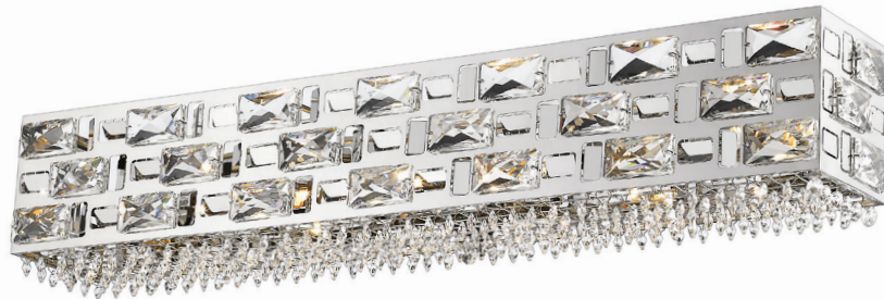
| J |