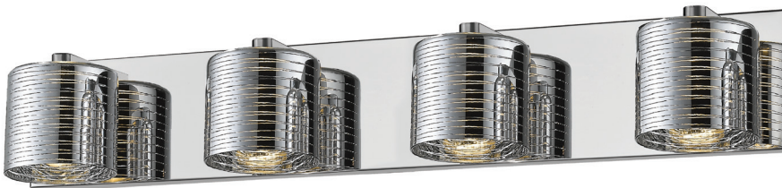
| H |