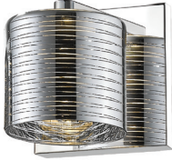
| E |