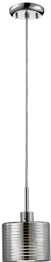
| A |

The Sempter collection is cutting-edge in every sense of the term. Cut glass shaded pendants in various shapes and sizes, hung at varying heights with a sleek Chrome finish, the Sempter family will add a modern touch to any contemporary decor.