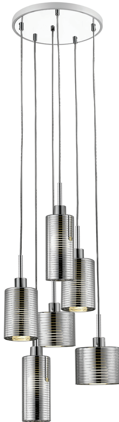
| D |