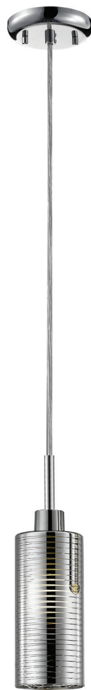
| C |