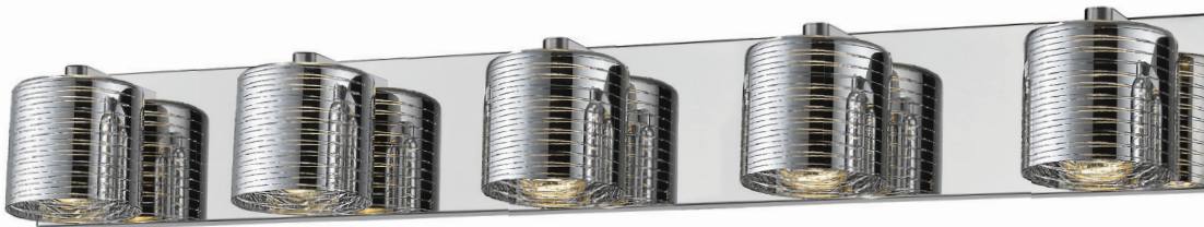
| I |