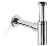
WSBC 53922 Our best seller