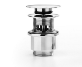
WSBC 53991 Push waste drain (click clack) with overflow