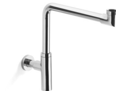
WSBC 53921 Space saving