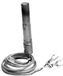
101934 Replacement Cartridge (F Spade Clip)