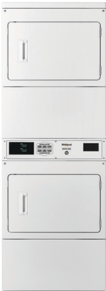
CSP2970HQ / CSP2971HQ

Why Buy: Get the capacity of two dryers in the space of only one.