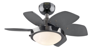
Reversible Graphite Finish Blades