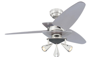
Reversible Silver Finish Blades