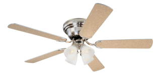
Reversible Bird's Eye Maple Finish Blades