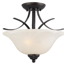
Dual Mounting Option Available