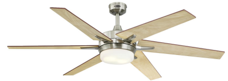
Reversible Light Maple Finish Blades