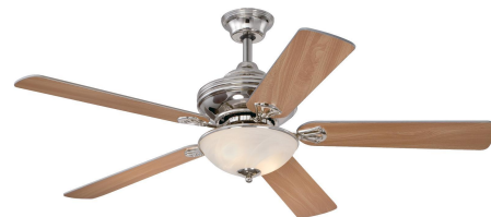
Reversible Beech Finish Blades