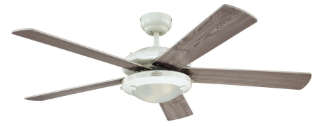
Reversible White Washed Pine Finish Blades