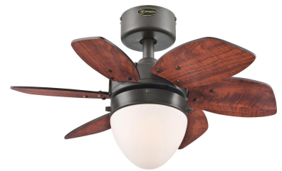
Reversible Applewood Finish Blades