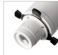
Optional Focusing Framing Projector Accessory FP-K