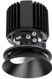
Shown Trimless For reference