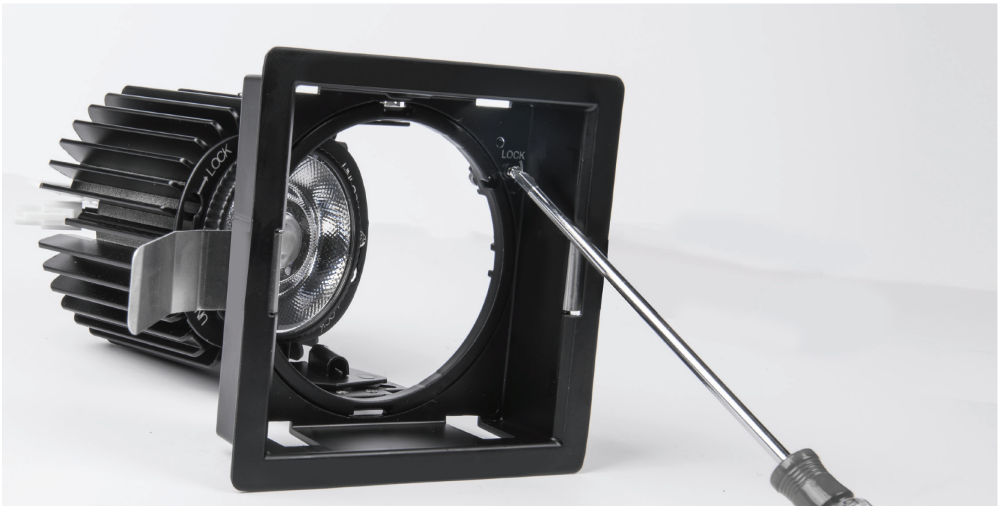
365° horizontal lockable hot aiming

wacighting.com Phone (800) 526.2588 Fax (800) 526.2585