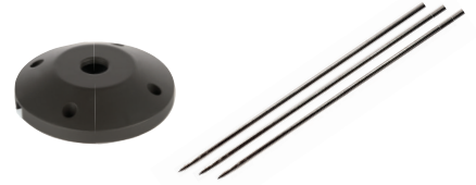
Includes three 7 inch threaded stainless steel stabilizing pins for ground mounting or surface mounts with four screws or over a junction box