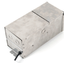
9600-TRN-SS 600W Max

waclighting.com Phone (800) 526.2588 Fax (800) 526.2585