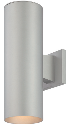
Surface Wall Mount E: 7 3 / 4 "