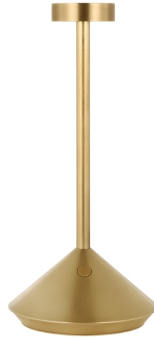
Hand Rubbed Antique Brass

Includes 120-240V 2.4 watts, 220 delivered lumens, 90 CRI 2700K LED module. Built-in three way dimming. Black includes black cable. White includes white cable. Hand Rubbed Antique Brass includes cream cable. 6 feet of USB C to C cable. Wall charger included.