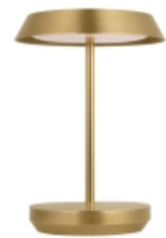
Hand Rubbed Antique Brass